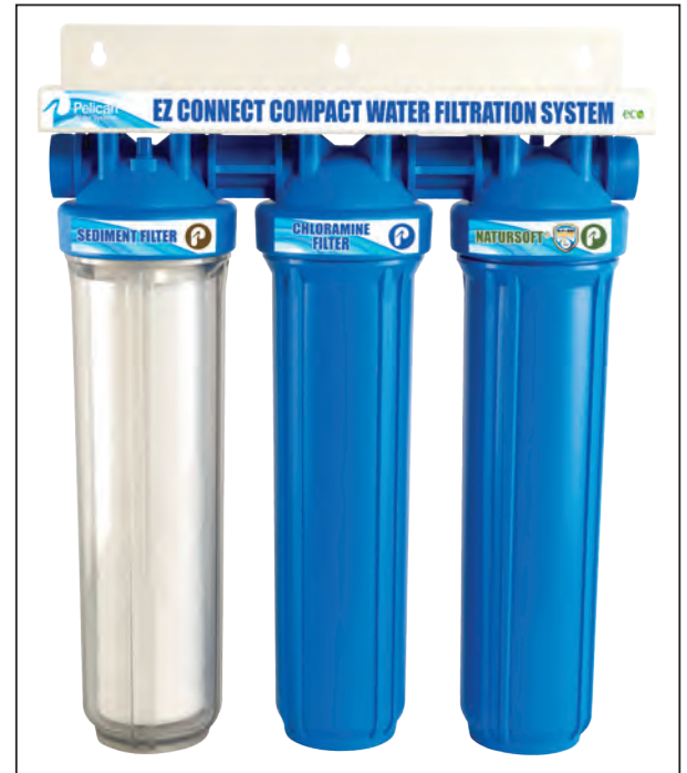
Front of Pelican EZ Connect PSE-500

If this or any other system is installed in a metal (conductive) plumbing system, i.e. copper or galvanized metal, the plastic components of the system will interrupt the continuity of the plumbing system. As a result any errant electricity from improperly grounded appliances downstream or potential galvanic activity in the plumbing system can no longer ground through contiguous metal plumbing. Some homes may have been built in accordance with building codes, which actually encouraged the grounding of electrical appliances through the plumbing system. Consequently, the installation of a bypass consisting of the same material as the existing plumbing, or a grounded "jumper wire" bridging the equipment and reestablishing the contiguous conductive nature of the plumbing system must be installed prior to your systems use.