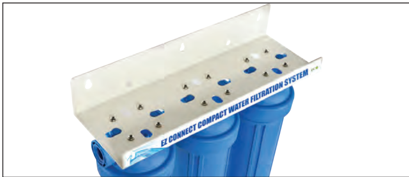
Top of Pelican EZ Connect PSE-500