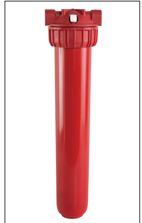
Front of Pelican Hot Water Post Filter