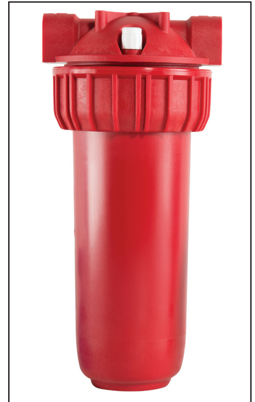
Front of Pelican Hot Water Post Filter